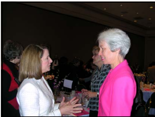
Sherri Greenberg and Gail Schoettler